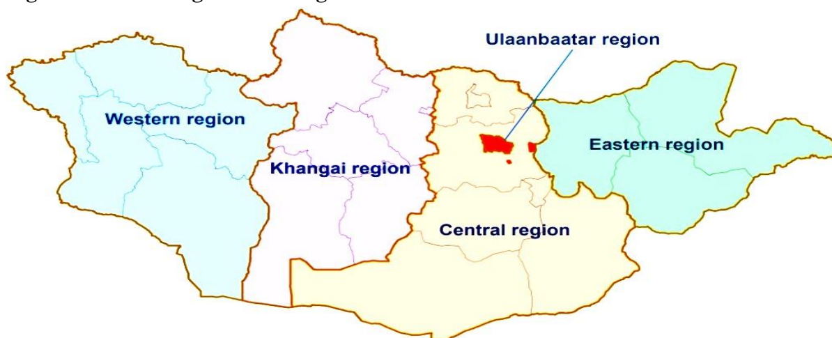
Fig. 1: Economic regions of Mongolia