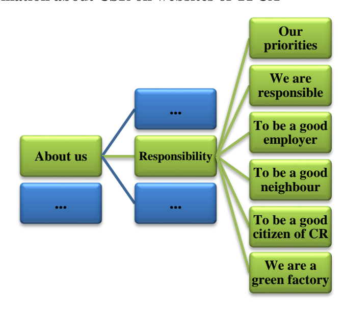
Fig. 3: Information about CSR on websites of TPCA

On TPCA's websites the bookmark Responsibility focuses on CSR. There the company communicates its priorities, its mission, its principles and its values, and it also declares its goal to be a good employer, good neighbour and good citizen and it also declares there its responsibility for the environment (section We are a green factory) – see Figure 3.