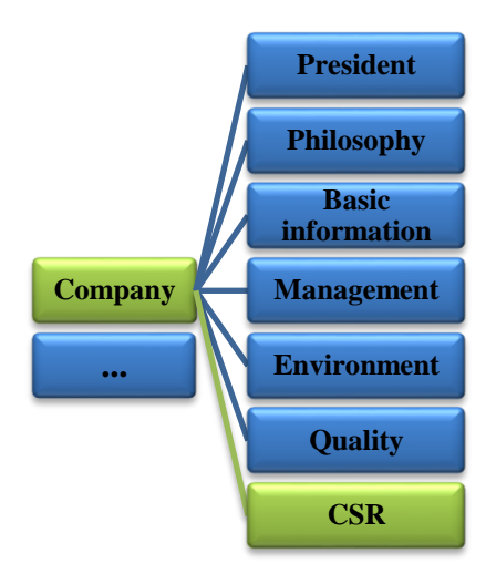
Fig. 1: Information about CSR on websites of HMMC

CSR has its own bookmark on the HMMC website. Social responsibility and the importance of environmental protection are also stressed in the presentation of the company in the sections President, Philosophy and Environment (see Figure 1).