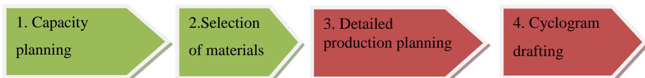
Fig. 1: The main stages of the order planning and execution process in VSMPO-AVISMA

It was found out that some improvements are possible at each stage and that there are reserves for efficiency growth. Changes are mostly required at the last two stages. Thus, the analyses of the production planning stage revealed that the Corporation huge stocks and a long production cycle. More detailed calculation of the production cycle is given in Table 1.